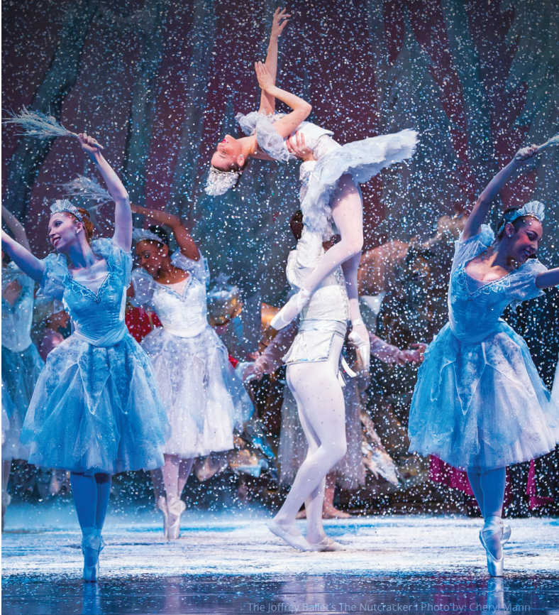
The Joffrey Ballerinas The Nutcracker

It's all happening in Illinois this winter.